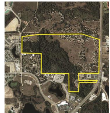
CHINA OWNED CHINA TRAVEL SERVICES, FORMER SPLENDID CHINA THEME PARK Land disposition