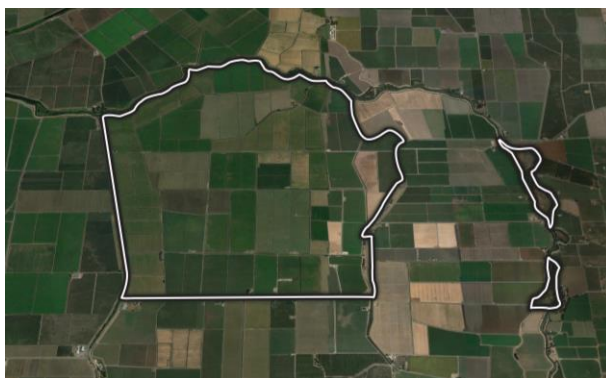
4,239 ACRES OF INSTITUTIONAL, AGRICULTURAL LAND IN THE SACRAMENTO DELTA Land disposition

Cushman & Wakefield has a long history of significant land transactions, such as the assemblage for the United Nations and the Sears Tower sites, and the sale of 19,572 acres in southeast Georgia for the Sea Island Company.