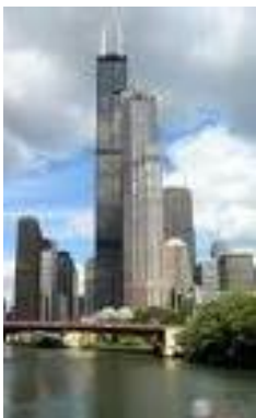
SEARS TOWER Land Assemblage