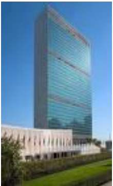
UNITED NATIONS Land Assemblage